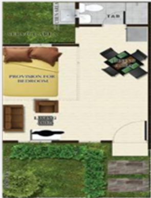
Ground Floor Inner Unit

Living Area Tiled Toilet and Bath Dining Area With Ceiling Kitchen Provision for 1 bedroom